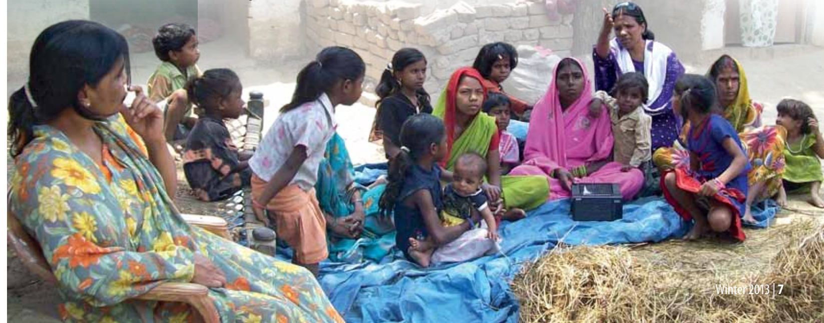
Setting up the JESUS film in Ethiopia