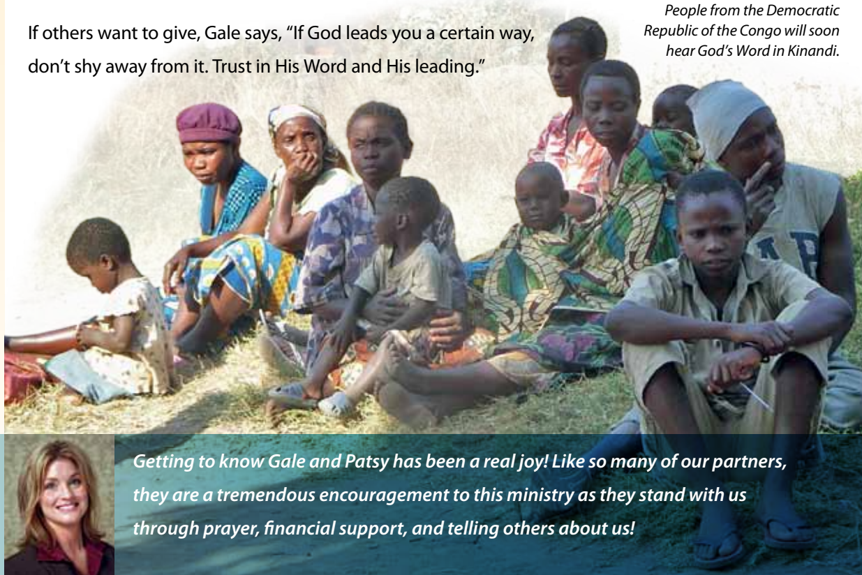
People from the Democratic Republic of the Congo will soon hear God's Word in Kinandi.